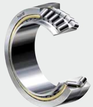
NKE tapered roller bearing