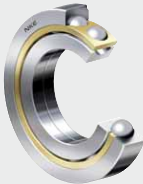
NKE four-point contact ball bearings