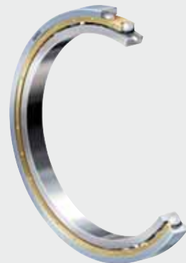
NKE deep groove ball bearings (with insulation coating on outer ring)