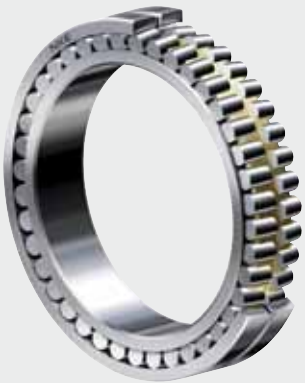
NKE spherical roller bearing