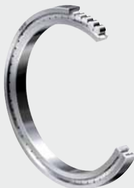
NKE full complement cylindrical roller bearing (without cage)